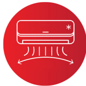
Wide Angle Airflow

Anticorrosive golden coating to protect against harsh conditions and improve heat efficiency