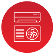
Factory Coated Gold Fins

Play it cool with our highly efficient and affordable split unit!