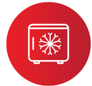
Refrigeration Radiation Technology

Protects the compressor by intermittently rotating the fan in reverse to get rid of sand and dust